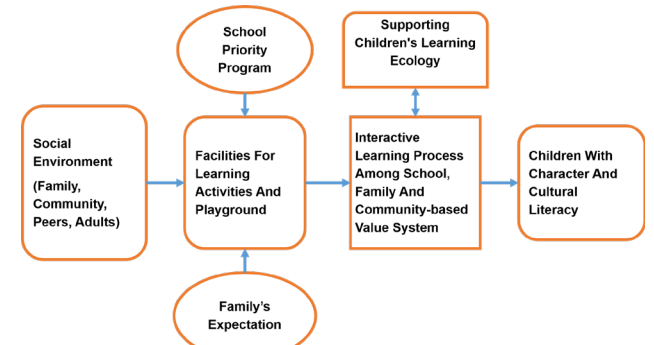
Figure 4. Pattern of Family Involvement in School