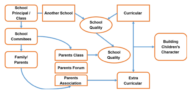
Figure 3. The Pattern of Developing School-Parents Partnerships

Partnership acceleration developed by schools and family involves the Yogyakarta sultanate to explore noble values and to involve the surrounding community. It also engages universities, which served as a partner in developing ideas for schools' and corporation's advancement and supporting funding as well as other facilitation installment. In general, the partnership built by the school can be seen in the following figure.